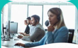
Through Life Support & capability Management