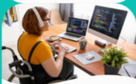
Building a Solution For You