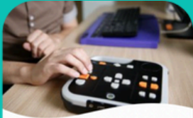
Services Client Journey