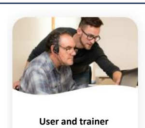
User and trainer assistive Software training

Simplifying the roll out of the capability to enable integration into the IT support systems and software rollout, patching and licensing processes.